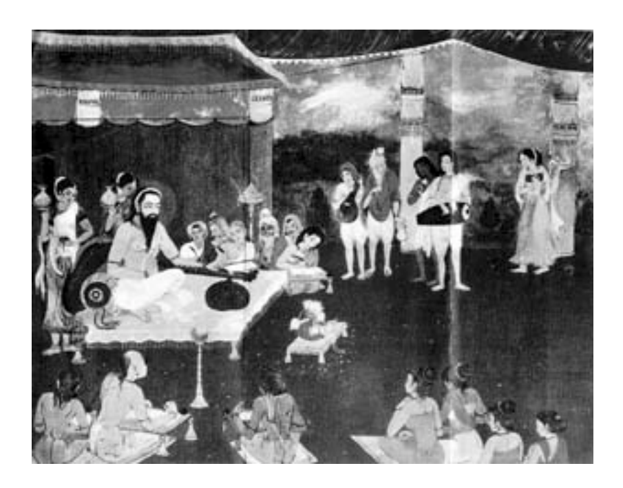
Fig. 1. Painting of Abhinavagupta as a celebrated Tantric guru, based on a contemporary tenth-century eyewitness description. (Reproduced from the frontispiece of K. C. Pandey, Abhinavagupta: An Historical and Philosophical Study, courtesy of Chowkhamba Sanskrit Series.)

on a soft cushion over a throne of gold with a canopy, decked with strings of pearls, in an open hall—full of crystals, beautified with paintings, smelling extremely sweet on account of garlands of flowers, incense and lamps, perfumed with sandal, etc., constantly resonant with vocal and instrumental music and dance and crowded with female ascetics and saints of recognised spiritual power—in the centre of a garden of grapes. He is attended by all his pupils...who are sitting, with their minds concentrated, at his feet and are writing down all that he says, and by two female messengers (D"tis), who are standing at the sides.... His right hand, wearing the rosary of Rudråk, a, is resting on the thigh, and his fingers are in the position indicative of the grasp of the Ultimate Reality. And he is playing upon the V/na, which is capable of producing original musical sound...with the tip of the nail of his lotus-like left hand.