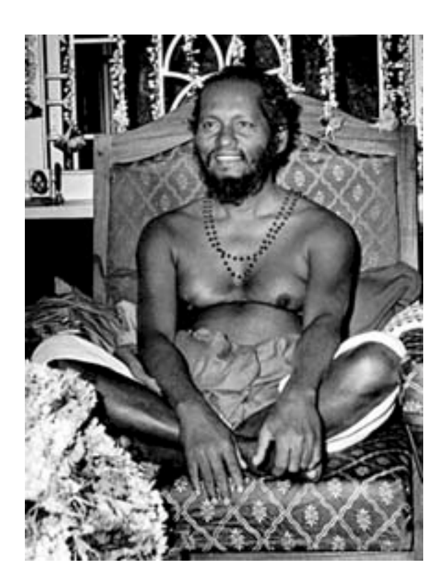
Fig. 2. Swami Muktananda giving darshan (spiritual audience) in the early 1970s.

...it presents him as a typical follower of the Kula system.... [T]he characteristic feature of...Kaulism is that it denies antagonism between sensuous joy and spiritual bliss (Ånanda); recognises the former to be a means to the latter; and emphatically asserts that it is meant for the few, who are highly proficient in the Råja-Yoga as distinct from the Hatha-Yoga, who have such control over the mind that they can withdraw it from the stimulating object even at a time when it is being enjoyed most.... ^8